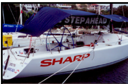
Call that a wheel??? THIS is a WHEEL!!

Every 4 years ISAF changes the racing rules sometimes with big effect (such as the new rules in 1997) sometimes with less effects. Sometimes the changes take effect on the water and in the protest room but not in the minds of the sailors. Has anyone shouted "Overtaking boat keep clear" recently? And its not long ago a protest was turned away on the grounds that yachts no longer need to fly a racing burgee rather than a cruising burgee ( That rule changed before I took up sailing !!)